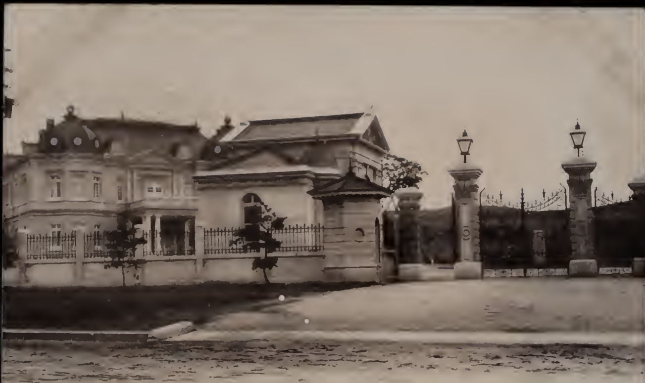
3) A Commander in Chief of buliding. 鮮々官令司軍樹駐鮮朝山龍 (景風鮮朝)